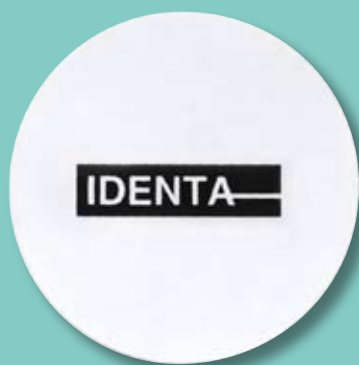
Top face (printable)