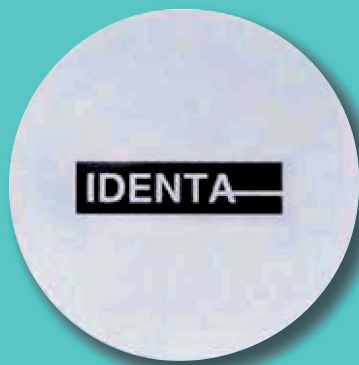
Top face (printable)